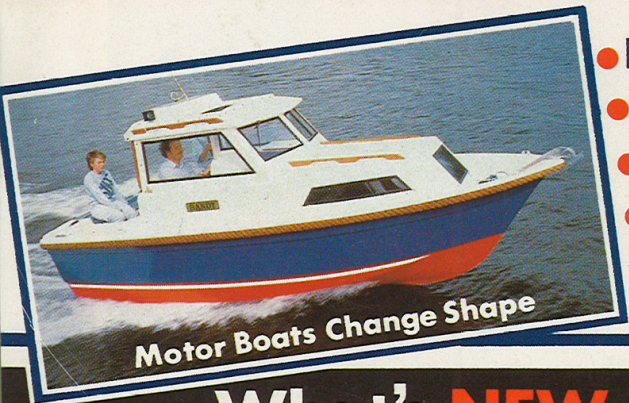
Motor Boats Change Shape